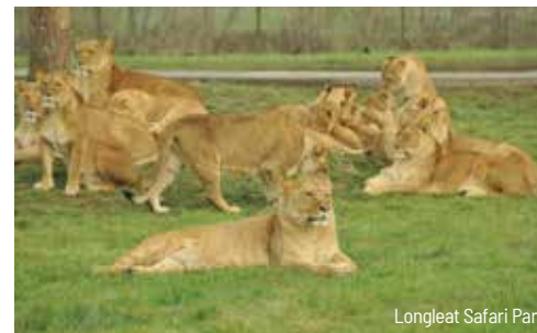
Longleat Safari Park

Admission included in price when marked with ***